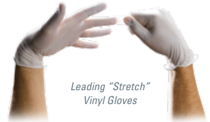
Leading "Stretch" Vinyl Gloves

LAVENDER* Exam Gloves are tested extensively to ensure Protection for users in a wide range of situations. LAVENDER* Exam Gloves ;