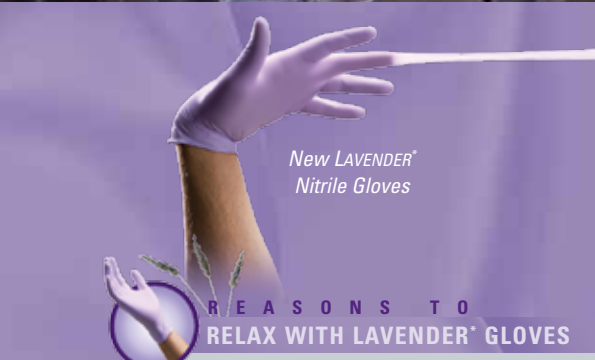
New LAVENDER* Nitrile Gloves