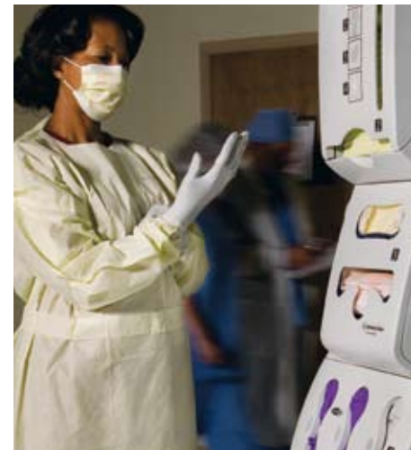
Image 4. Improving PPE selection and use compliance relies on having a systematic process in place which enables the HCW to do the right thing.

of system barrier identification and correction must be set into place where compliance is monitored and feedback provided to all critical departments and personnel. When that performance improvement cycle is completed, the process must begin again. This is not a fix it once and forget it issue!