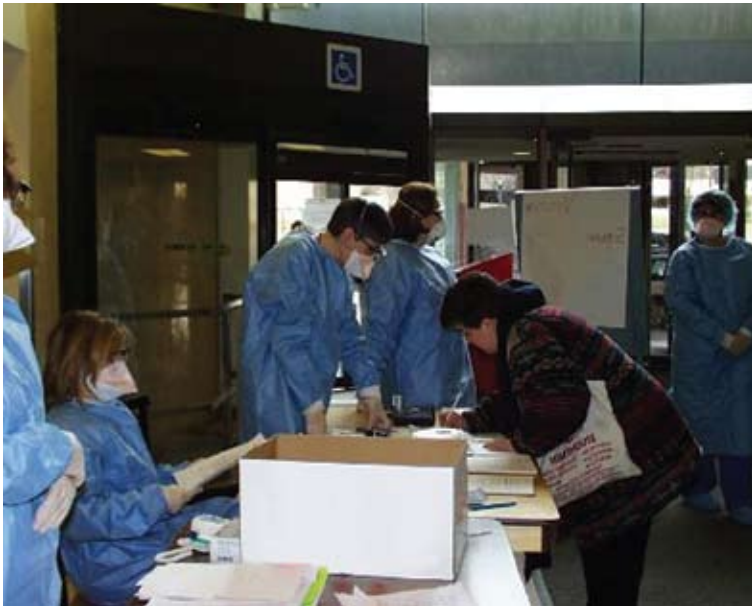
Image 1. The SARS outbreak in Toronto illustrated the critical importance of PPE use in healthcare facilities (Image Courtesy of University Health Network, Toronto, Canada).

clothing, blood, body fluids, secretions and excretions. 1 Contact Precautions, a component of the Transmission-Based Precautions, recommends routine use of gowns along with gloves for all patients infected with multi-drug resistant organisms (MDROs) and for patients who have been previously identified as being colonized with methicillin-resistant Staphylococcus aureus (MRSA) or Vancomycin-resistant Enterococcus (VRE). The goal of Transmission-Based Contact Precautions in addition to Standard Precautions is to prevent cross-transmission of other potentially infectious materials (OPIM) that may contaminate the environment, common use equipment and HCWs' clothing. According to the 2007 Isolation Guideline, the need for and type of isolation gown selected should be based on the nature of the patient interaction including (1) the anticipated degree of contact with infectious material and (2) potential for blood and body fluid penetration of the barrier apparel. The likelihood of strike-through, leakage and soak-through of an isolation gown is procedure dependent.