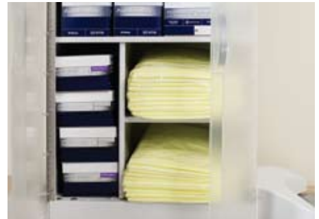
Image 3. Ensuring a consistent supply of PPE is critical to overcoming potential barriers to selection and use.

There may also be system factors which pose as obstacles to appropriate gown selection and use - such as who makes the system level choices on gown types and the selection criteria used. Are there storage space issues at the warehouse,