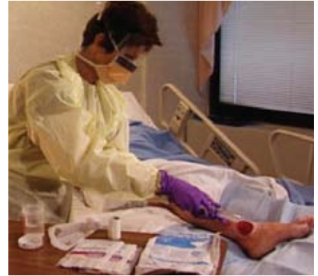
Image 2. The most important consideration when choosing protective apparel is its functionality. 7

The most important consideration when choosing protective apparel is its functionality. 7 Does the product demonstrate the necessary attributes required by the purchasers and users and purported by its manufacturer to possess? Barrier fabrics, at a minimum, should perform three basic